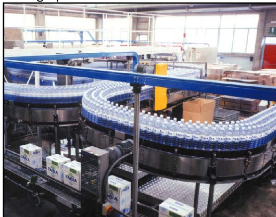
Photograph with a border