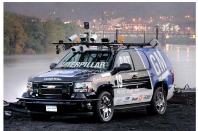
Figure 1, Boss intelligent vehicle; winner of the DARPA urban Challenge.

In this mini-program, students will be introduced to the fundamental communication, sensing and perception technologies for intelligent vehicles. It consists of 3 courses given by experts from TU/e and from the automotive industry. These courses include lab experiments, to give students hands-on experience with state-of-the-art technology. Students following this mini program, furthermore have the opportunity to do their final bachelor project in this context, so as to obtain real-world immersion in the subject matter.